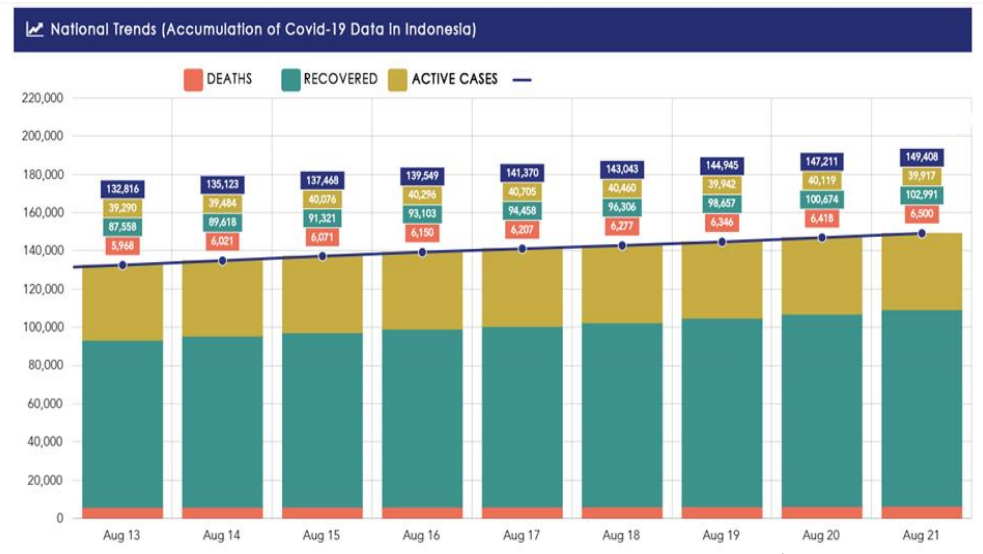
Figure 2: Data of Covid-19 Growth in Indonesia (August, 21<sup>th</sup> 2020)

Covid data in Indonesia on August 21<sup>st</sup> 2020 reported 149,408 patients confirmed positive or increased 2,197 cases from the previous day. Graphically, the development of the Covid-19 case in Indonesia is still up or on an upward curve, as seen in the following figure: